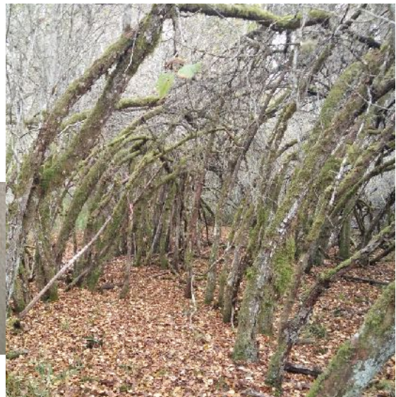
Lost local orchards yield their mysteries to Madrona!

and Wild Hybrids: Bringing the Past into Our Fruitful Future." Listeners learned how locally-adapted and diverse fruits can help us be more resilient in the face of changes.