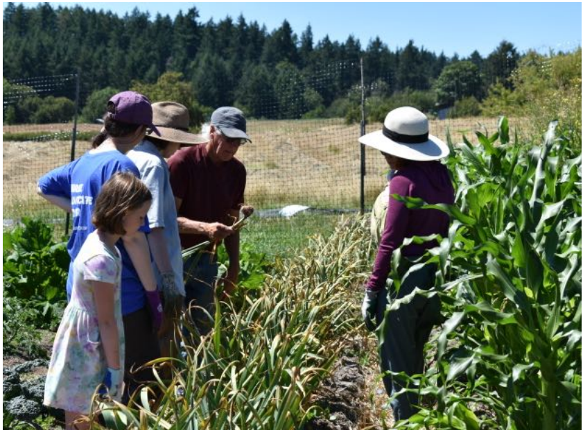
Learning to grow food together is a key component of the Overmarsh Farm Commons project

This project reflects the Grange's long-term vision of regenerative agriculture, community empowerment, and cultural preservation at Overmarsh Farm Commons. It will be a model for teaching essential food-growing skills while honoring the island's rich agrarian past and cultivating a self-sufficient future.